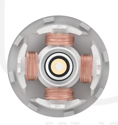
Upgraded Driver IC

Hybrid frame structure maintains stability without sacrificing fan blade size and performance.