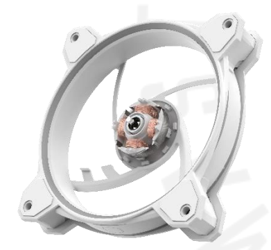
Hybrid Frame Design

Increased fan blades to deliver better air flow and cooling performance.